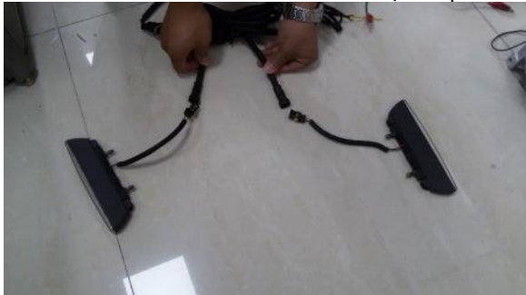
(Plug wire loom into light plugs)