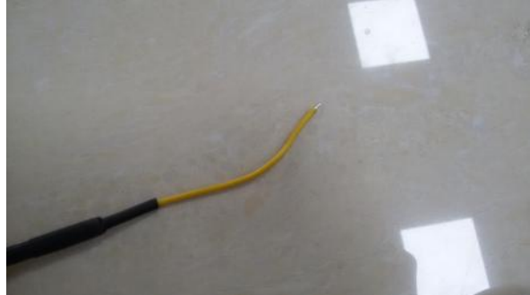
(Optional- Connect yellow wire to auxiliary power-like back up lighting)

For Technical Support/Warranty Information please call 310-762-9944