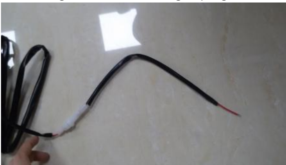
(Connect Red wire to positive terminal on battery)