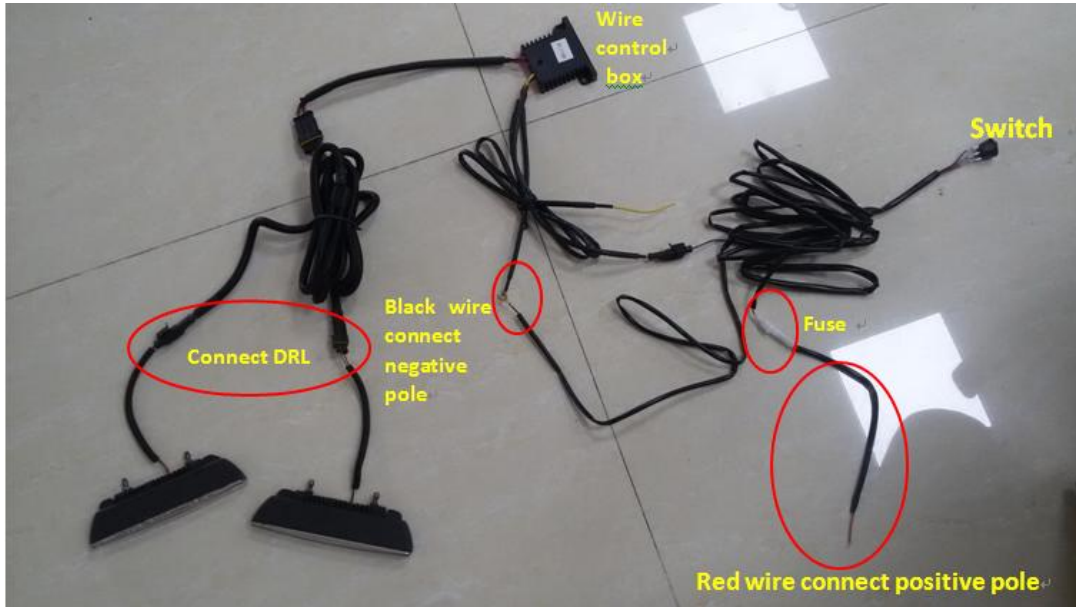
(Complete Wiring Set up)

Part # 612800-04 Light Kit for 76858 and 76614 Rear Bumpers