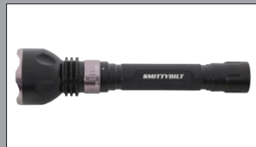
T-6061 Mil Spec type 3 hard anodized finish