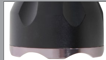
Tactical strike crown head