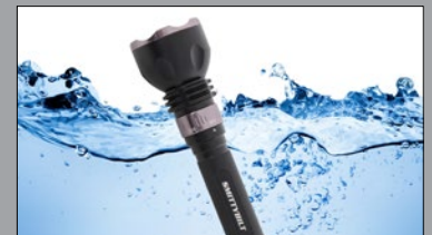
IP68 Rating Waterproof up to 35 feet