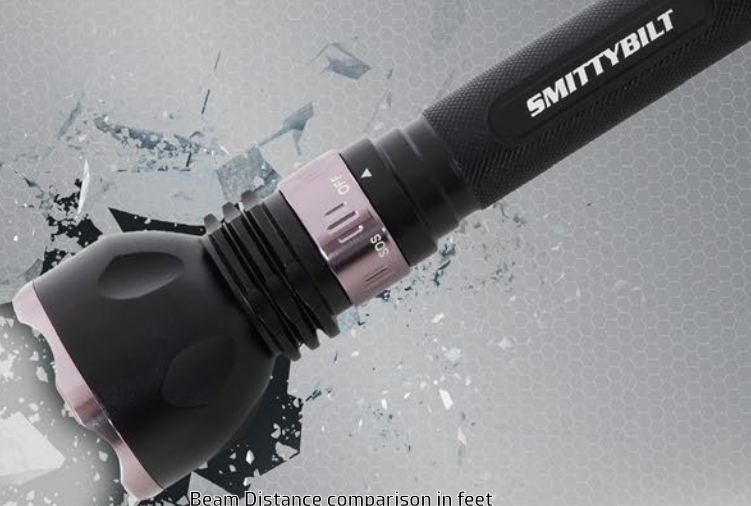
Beam Distance comparison in feet