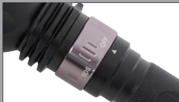
5-Setting On-Off Switch