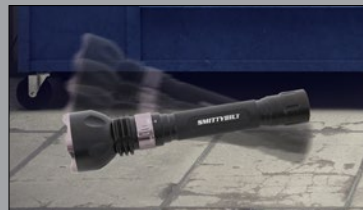
Impact resistant up to 5 feet drop