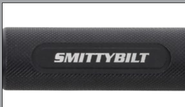
Tactical grip handle