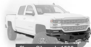
Chevy Silverado 1500