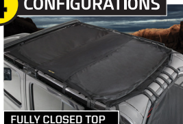
FULLY CLOSED TOP