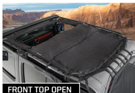
FRONT TOP OPEN