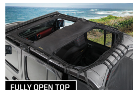
FULLY OPEN TOP