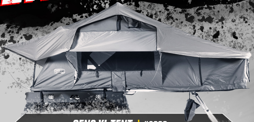
GEN2 XL TENT | #2683