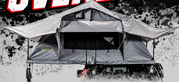
GEN2 STANDARD TENT | #2583