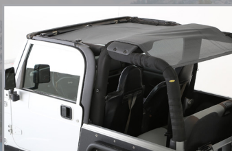
Jeep TJ (shown) No Header Required