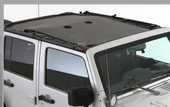
Jeep JK 4DR (shown) No Header Required