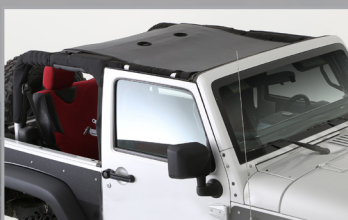
Jeep JK 2DR (shown) No Header Required