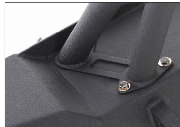
Removable bull bar 1.75" .120 wall overrider and kickers