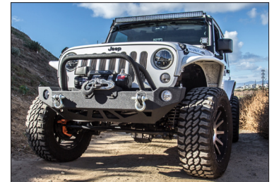
Raised corners for better entry and exit under the most extreme conditions