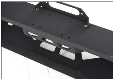
Unique triangulation anchor fastens to frame in multiple locations