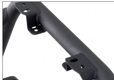
Integrated Gen2 light mounting tabs on the bull bar