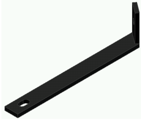
1500/2500/3500 Front Brace