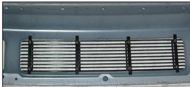
Figure 3 – Billet grille is secured on bumper