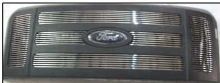
Figure 6 – Front View of positioning all six Billet Grille