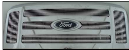
Figure 3 – Front View of positioning all six Billet Grille