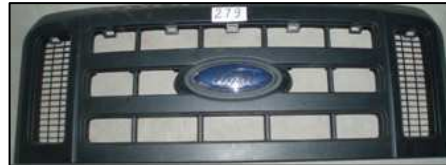
Figure 5 – Grille shell with uprights