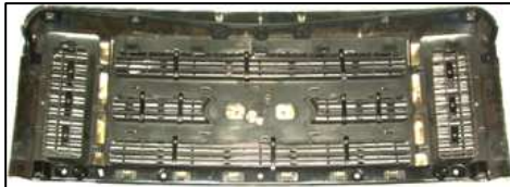
Figure 4 – Rear view of vehicle's shell; Billet Grills attached with Metal Brackets and Flange Nuts