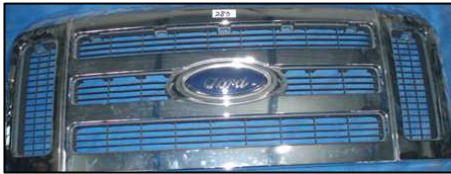
Figure 2 – Grille shell with grid