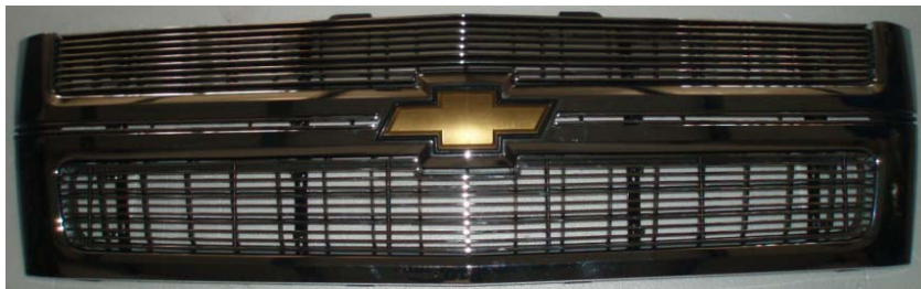
Figure 2 – Front View of positioning lower Billet Grille