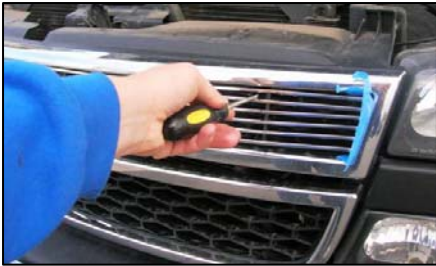
Figure 3 – Attach Upper Billet Grille piece