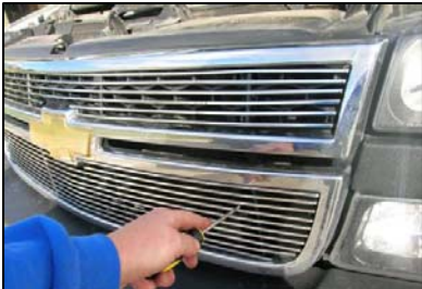
Figure 4 – Attach lower Billet Grille piece

For Technical Support/Warranty Information please call 310-762-9944