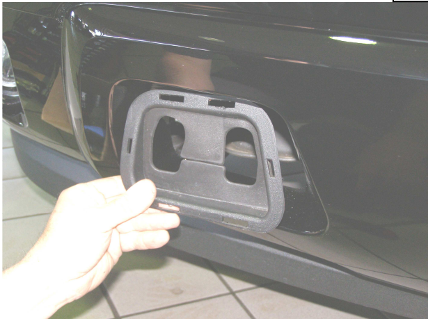
Fig 1 (Passenger Side)