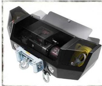
Black Box (#2805)