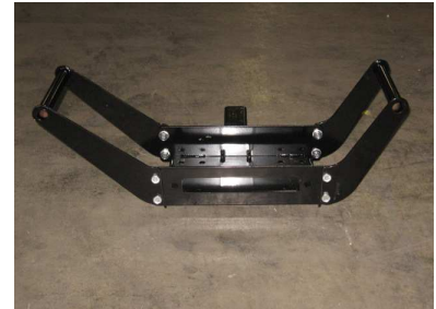
Winch Cradle (#2811)