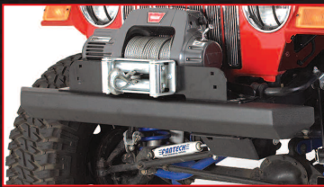
Classic Bumper shown without D Rings