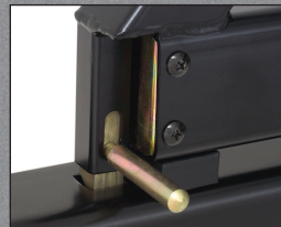
Heavy-duty latch mechanism keeps your tire secure.