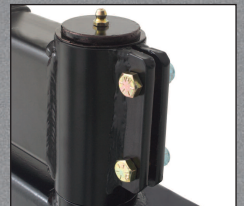
Custom grease fitting keeps hinge clean and smooth after years of use.