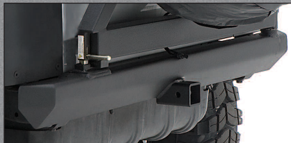
Swings away allowing the use of your tailgate.