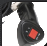
HAND HELD REMOTE