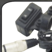
HANDLE BAR REMOTE