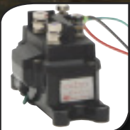
200 AMP SOLENOID